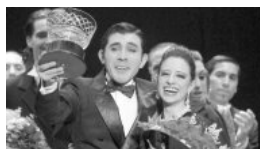
Enterrianos participated in the 2014 World Tango