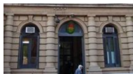
A man tried to blackmail a congressman and was sentenced