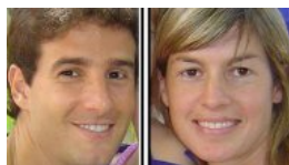
The public trial and start a TV producer and his wife