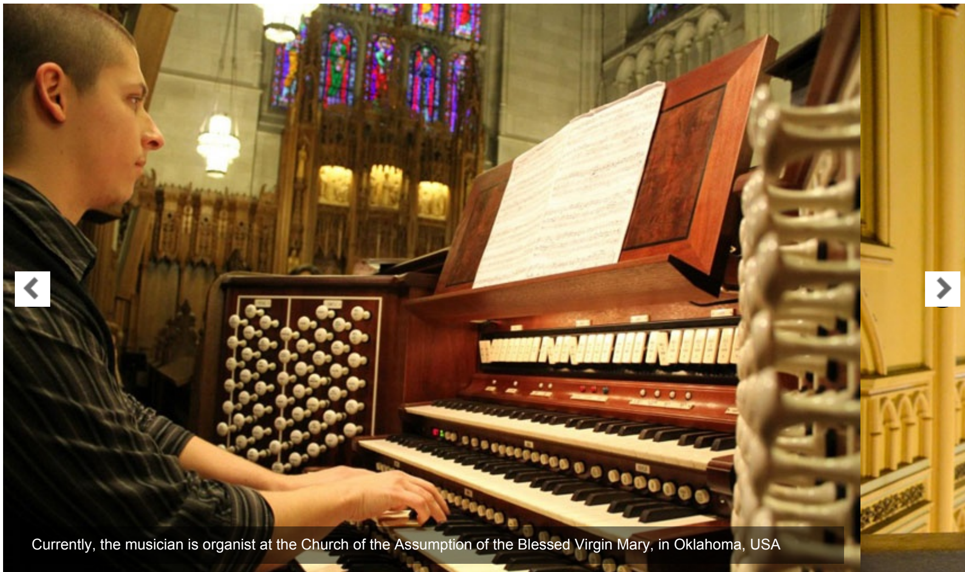
Currently, the musician is organist at the Church of the Assumption of the Blessed Virgin Mary, in Oklahoma, USA